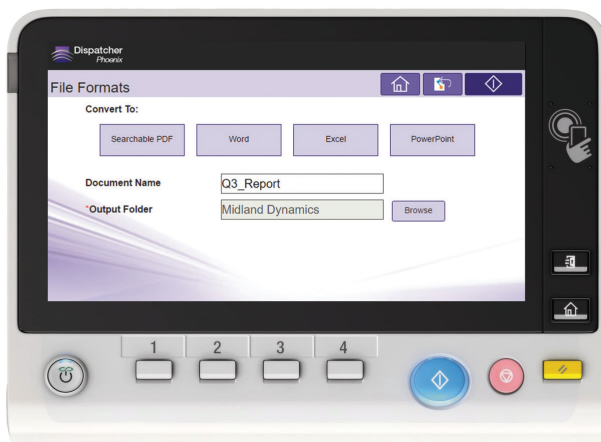
Index and process your documents at scan time.